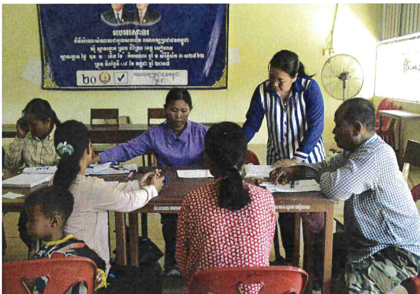
Operating AC in Speanthnat, Chikraeng District, carrying out loan-transactions. 29 th Nov 2018.

EASY indicators are very relevant in terms of quantities. Some indicators have been supplemented by additional explanations to reach a proper description of implementation quality. Indication of project outreach has been further detailed.