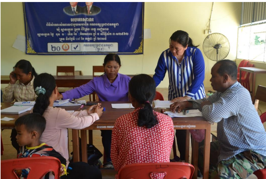
Operating AC i Speanhnat, Chikraeng District, der udfører lånetransaktioner. 29. november 2018.

EASY indikatorer er meget relevante i mængder. Nogle indikatorer er blevet suppleret med yderligere forklaringer for at nå en ordentlig beskrivelse af implementeringskvaliteten. Indikation af projektudfald er blevet nærmere beskrevet.